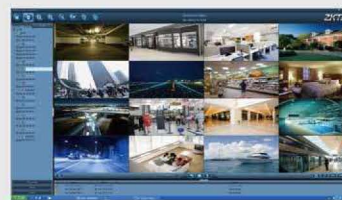
ZKVISION Software(Included in CD)